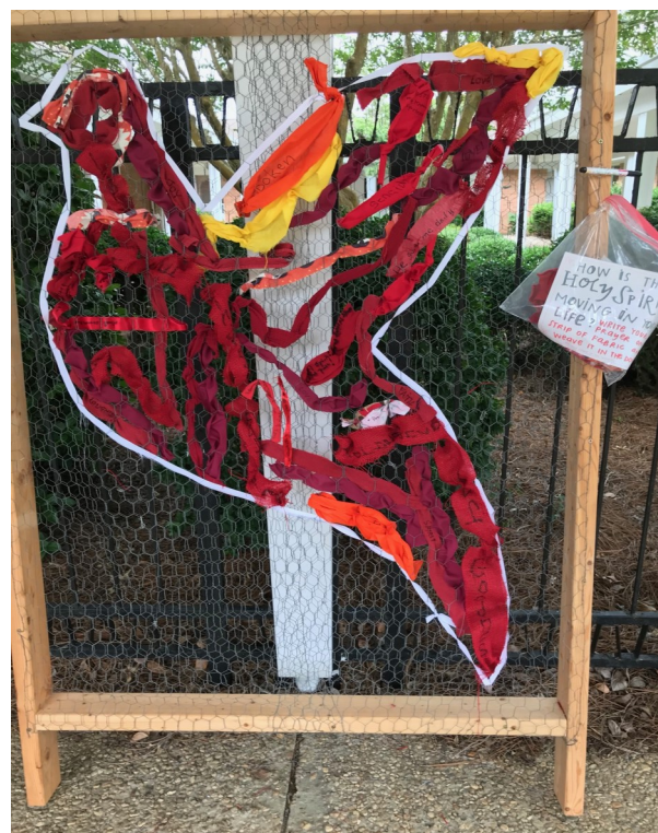
Our church celebrated the gift of the Holy Spirit with a virtual Pentecost Sunday Service (May 31).